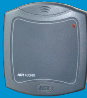
ACT 433RX Receiver