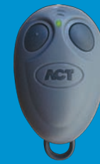
ACT 433TX / ACT 433TXprox Transmitter