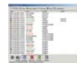
ACTWin Smart Software