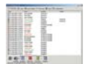
ACTWin Smart Software