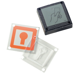
AC-3102 Panel Mount