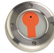
AC-3101 Vandal Resistant